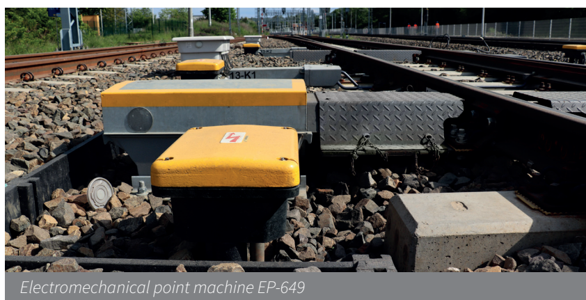
Electromechanical point machine EP-649

For single multiple-lock points with higher throwing resistance the multiple point machine control can be used.