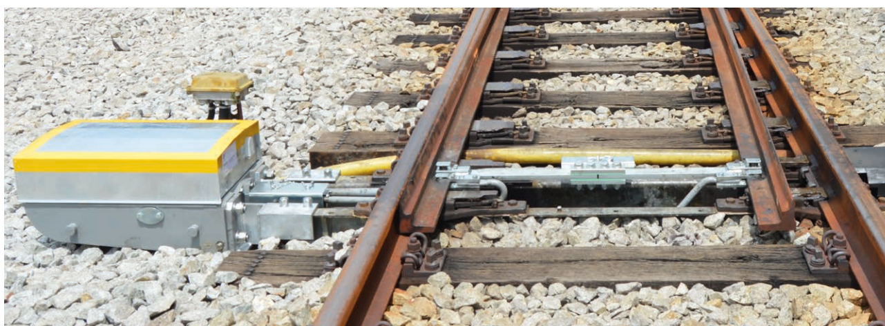
EPZ-6xx located in E-MAS depot – Malaysia

EPZ-6xx are designed for points without external locks and with coupled tongues whose throwing resistance does not exceed 4.5 kN.