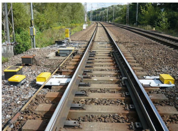
SPA with the point