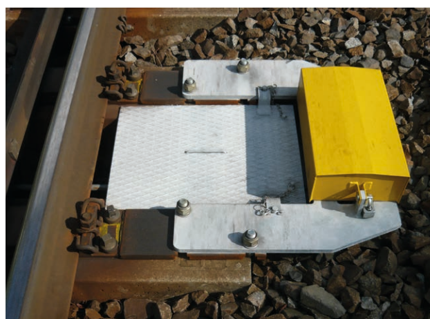
SPA – detail of installation