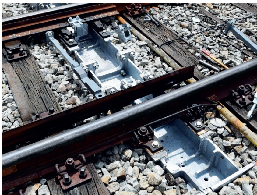
Narrow ZP-01 – divided variant (point reconstruction)

ZP-01 is made entirely as a weldment. ZP-01 in divided variant is made of two pieces of identical weldments screwed together in the middle.