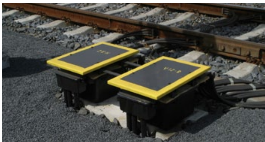
DT 075 C impedance bonds

The required oil capacity is approx. 15 litres.