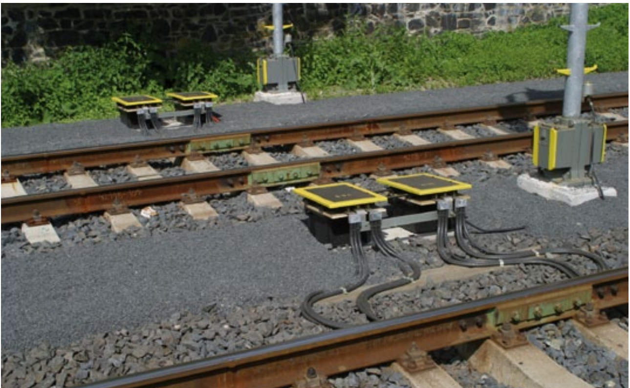
Impedance bonds connected to track circuits