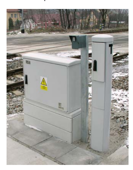
VTO 3–5 variants allow communicating on two independent lines over local or trunk cable.

VTO outdoor telephone object provides reliable connection of railway personnel on track with personnel at stations or with users of railway service telephone net.